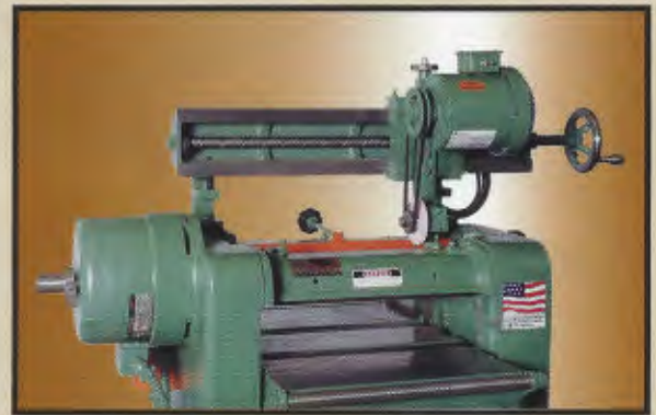
Photo shows Knife Grinder with grinding wheel in place. Grinding attachment can be left on the machine with dust hood in place.