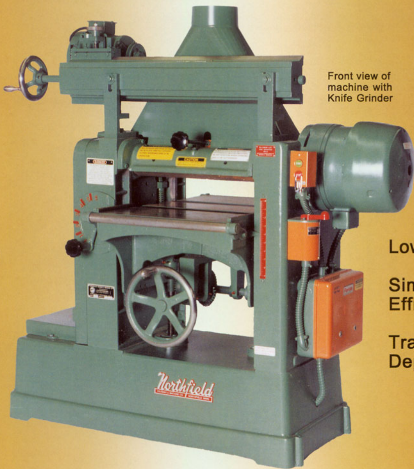
Front view of machine with Knife Grinder